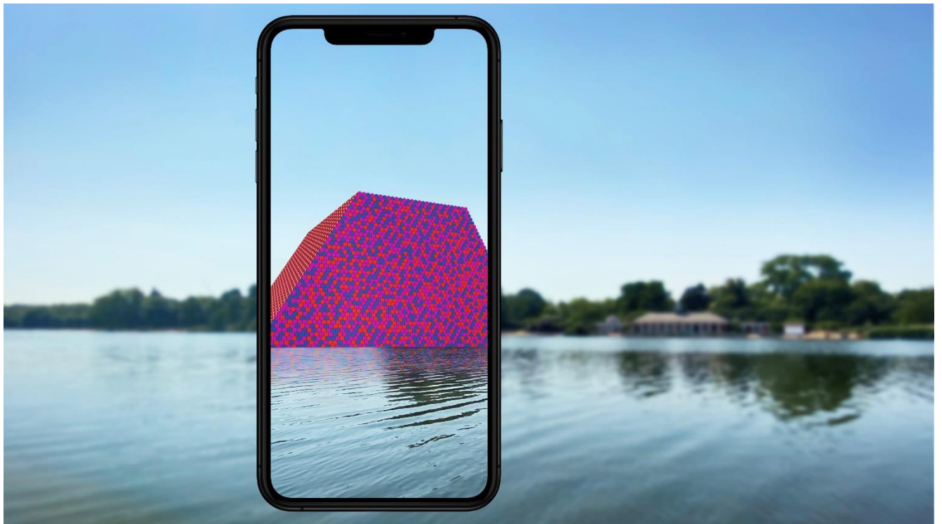
Christo and Jeanne-Claude, still for The London Mastaba AR (Hyde Park) , 2020.

Artists' final large-scale public artwork recreated in Augmented Reality by Acute Art in collaboration with the Serpentine Galleries